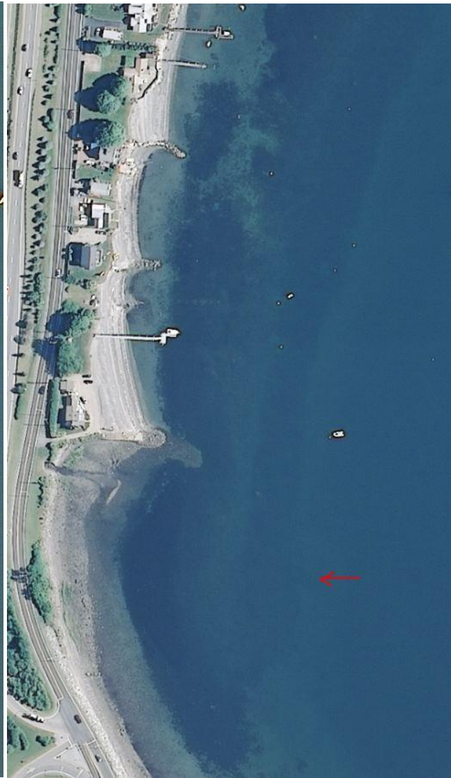
Figure 1. A) The orthophotography spectral statistics were manipulated to enhance the photo signature of SAV beds. B) The orthophotography without the special statistics manipulation. The red arrow points to the same bed edge in both images, which is easily viewable on the left image. The scale of both images is 1:2000.